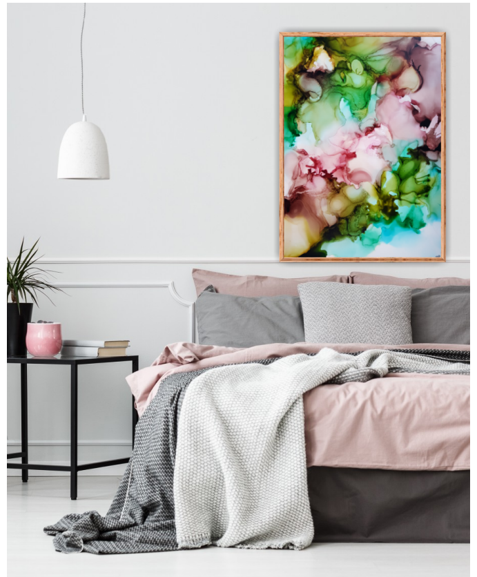
Into the Woods